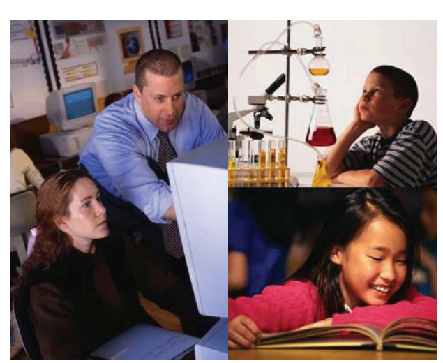
We provide innovative consulting services that enable your organization to meet your stakeholder's needs.

We understand that every institution and project is unique, and our approach provides a flexible and specialized team of consultants specifically chosen and engaged for each individual client. We are involved in short- and long-term projects in most markets.